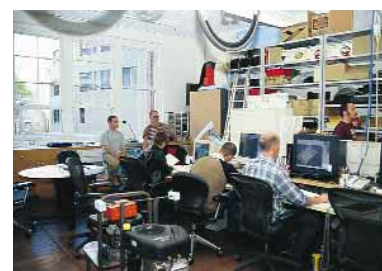
right Illustration of Quantum seats at Soldier Field, the konstrukt team and the working studio